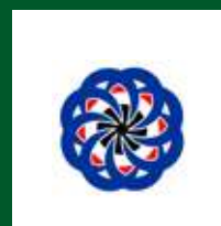
Iraqi Private Banks Association