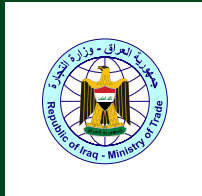
Ministry of Trade